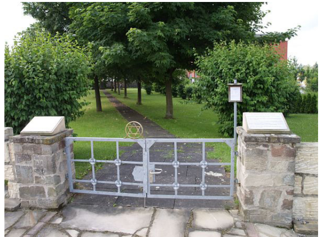
Entry of the Old Jewish Cemetery in Volkarsen.