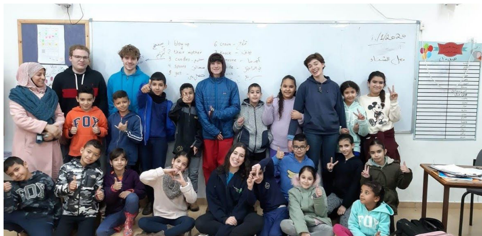
Posing on our last day at school with one of the fourth-grade classes.

Even still, the past five months have been without a doubt the best of my life. Israel provided me with half a year of infinities to which I will never be able to do justice in either writing or speaking. I thank the JCNCF for their support in making this experience a reality. It's easy to take for granted the incredible privilege of growing up within a religiously diverse and welcoming Jewish community. One that encourages questioning and challenging and standing up for what's right. And one that agrees on the correct consistency of a pancake.