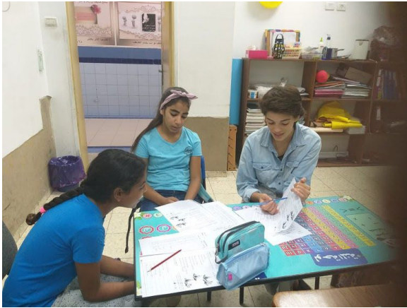
Teaching English in Zarzir.