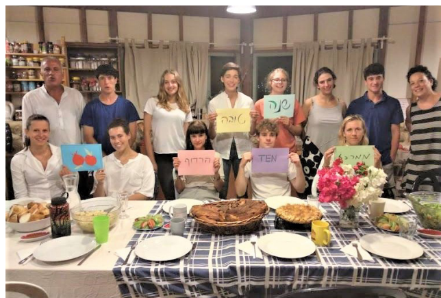
Celebrating erev Rosh HaShanah.

Conversely, when out in greater Israel society I felt considered too liberal a Jew and, by some, not even a Jew because of my parents' lineages. Some of the strictly traditional took the liberty of explaining what Shabbat and the mitzvot are, while a girl I chatted with on a bus told me that as part of the Conservative movement I'm "not on the right path". Of course these few irritating instances are nowhere near representative of all Jews in Israel. However, each time I was "Jewsplained" to or avoided on the sidewalk or shot a sideways glance at, it served a stinging reminder that I had not yet found my place. For living in the Holy Land I did not feel wholly landed.