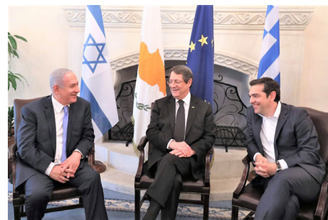
From left, Israeli Prime Minister Benjamin Netanyahu, Cypriot President Nicos Anastasiades and Greek Prime Minister Alexis Tsipras met at Cyprus's Presidential Palace in Nicosia in May.

Cyber 2.0, a leading Israeli cyber security company recently offered almost $30,000 to any person or company that could successfully hack into its new Cyber 2.0 system, which, unlike any other system, operates on the basis of the mathematical principles of chaos. The competition was open to hackers from across the globe, and hundreds participated, launching