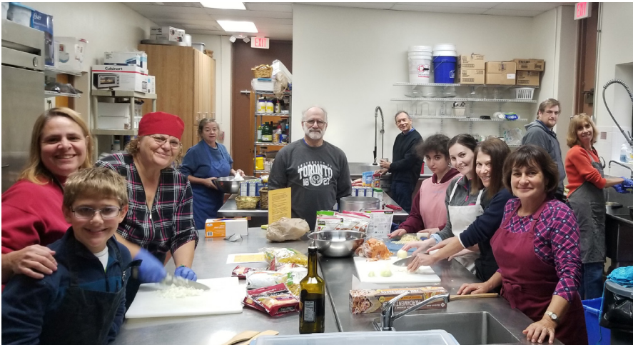
Congregation B'nai Israel's casserole

We are proud to be your partner in Tikkun Olam !