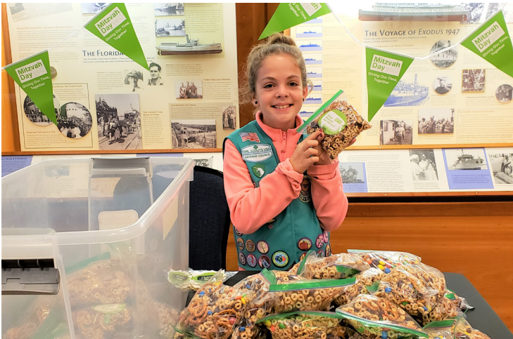
Troop 709 volunteers

took part in 9 different hands-on projects at Congregation B'nai Israel.