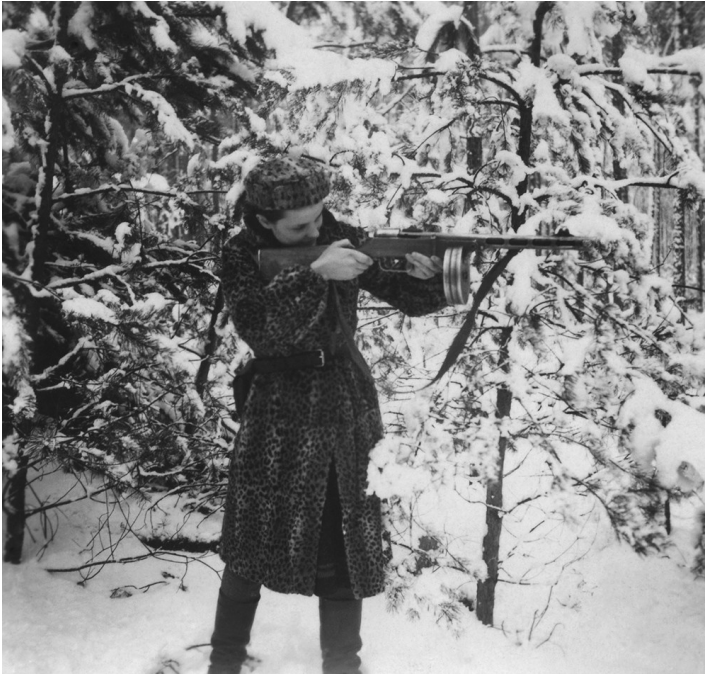
"This photo is really part of my history as a partisan. This is my 'new' automatic rifle.... I really had to practice how to shoot this one." Date: End of Winter 1943