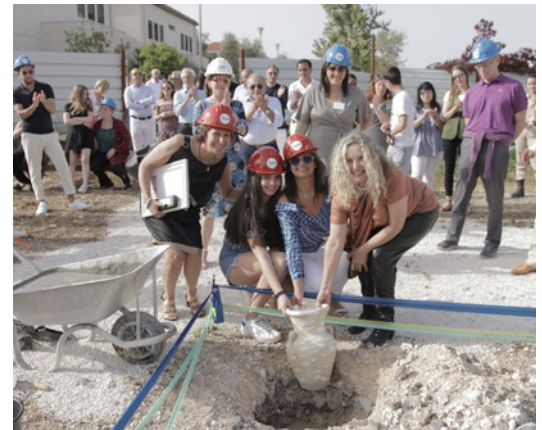
April groundbreaking ceremony for the fourth house

We look forward to joining you in January and to sharing more about the Village. We thank you so very much for your continued and critical support of our girls. Wishing all of you a happy, healthy, and prosperous New Year! Thank you for helping to save a world entire.